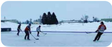
Park restroom facility upgrades, addition of an outdoor ice skating rink, and replacement of trees (post derecho)