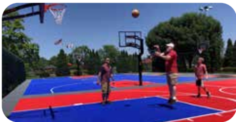
Complete renovation of outdoor basketball courts and hoops, tennis courts and addition of pickleball courts