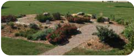
Expansion of Foundation offices building and renovation of Dolly's Flower Garden