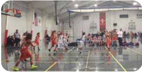
Facility upgrade to the GARC, including LED lighting for all basketball courts